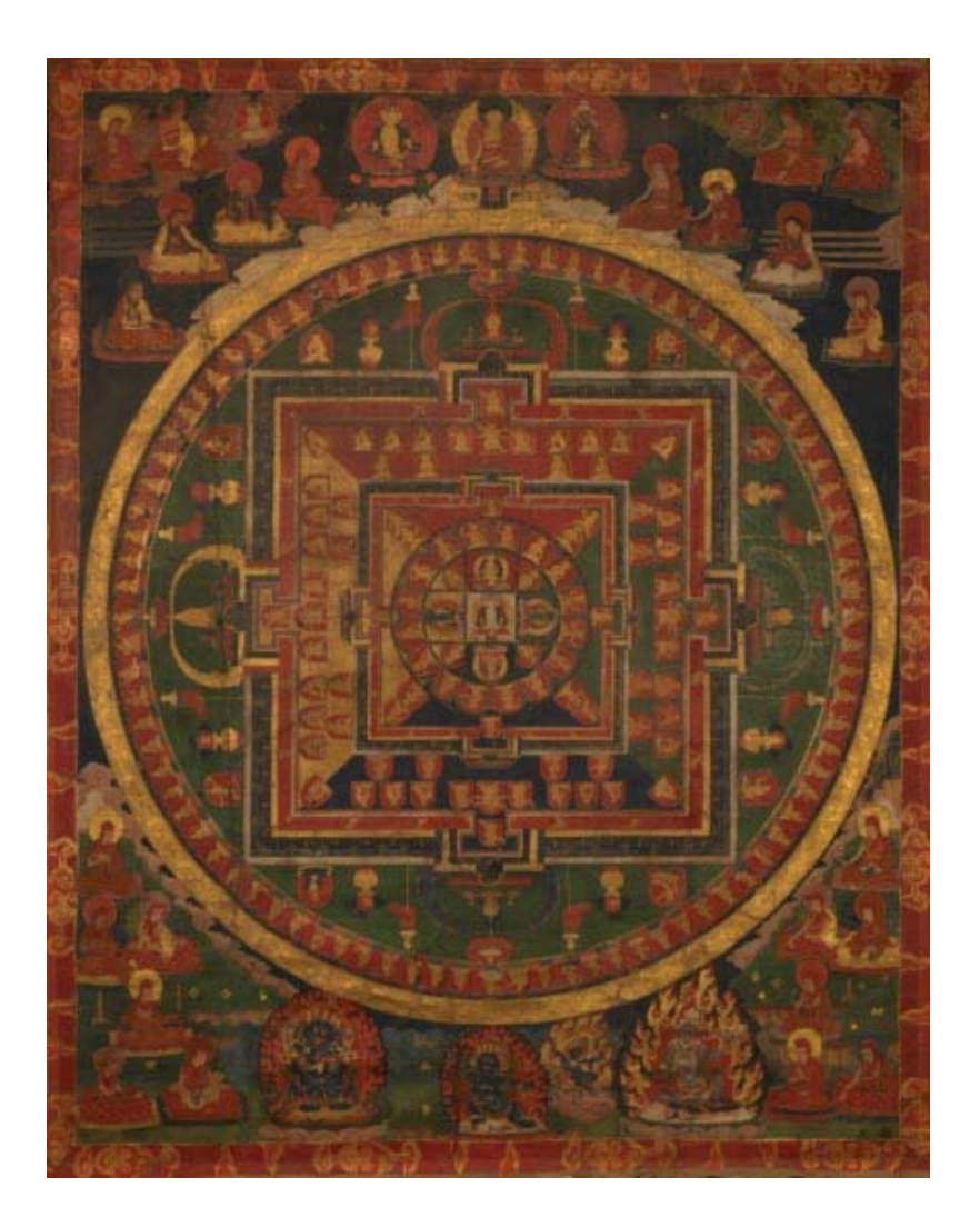
Mandala of Sarvavid Buddha Vairocana. Tibet; 17<sup>th</sup> century. Ground mineral pigments on cotton. Rubin Museum of Art.